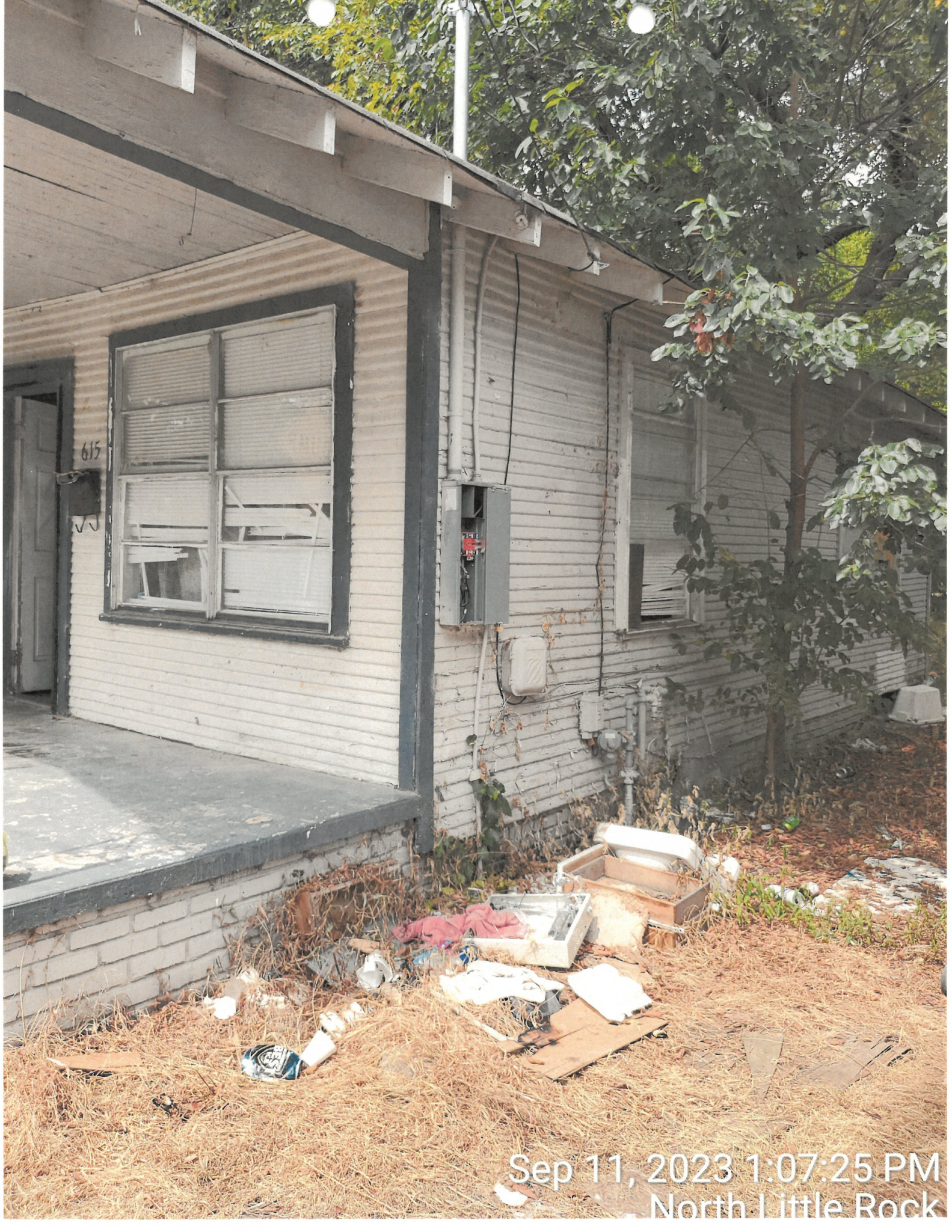
Sep 11, 2023 1:07:25 PM North Little Rock