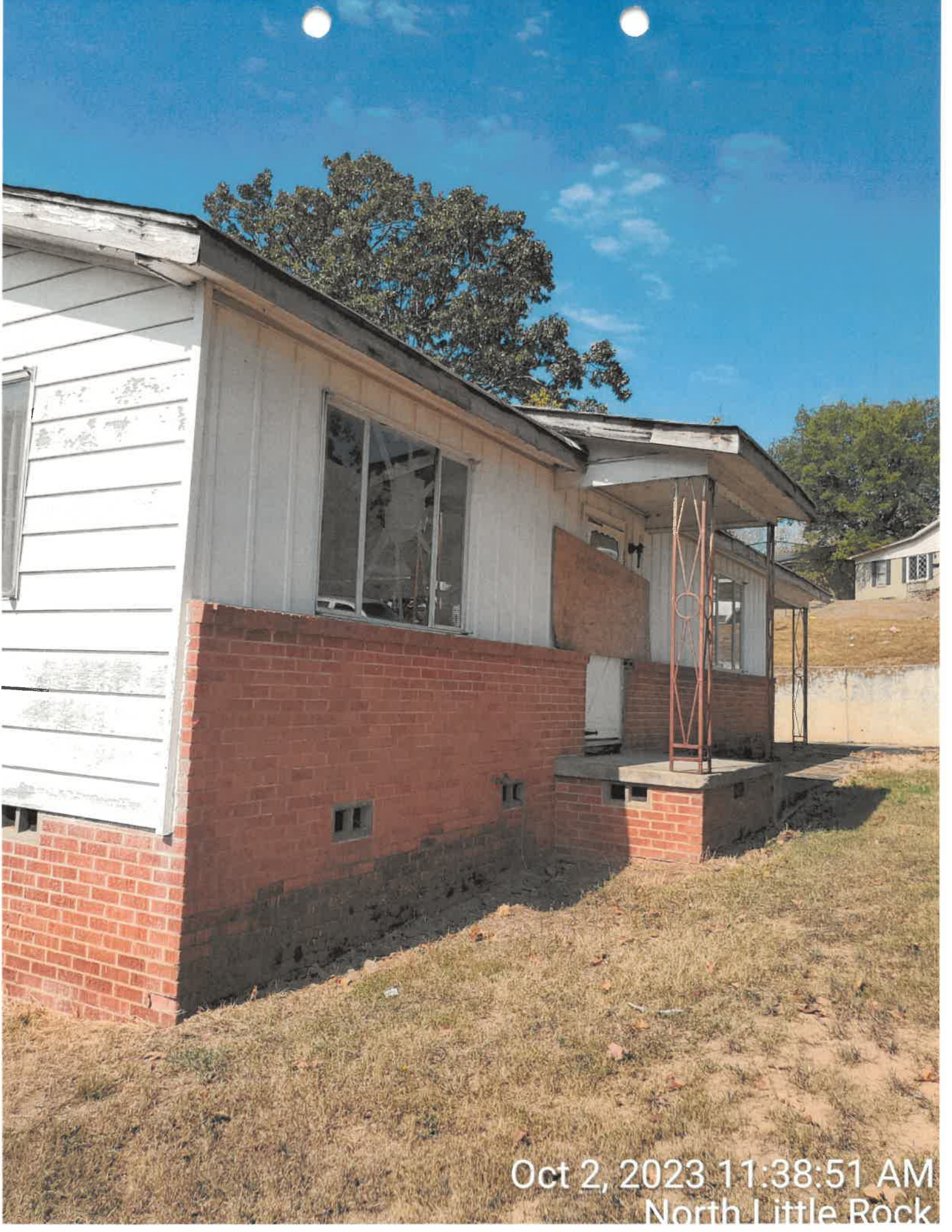
Oct 2, 2023 11:38:51 AM North Little Rock