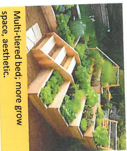
Multi-tiered bed; more grow space, aesthetic.