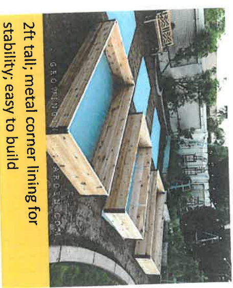
2ft tall; metal corner lining for stability; easy to build