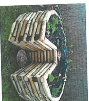
Keyhole design; can use compostable scraps to add nutrients to the soil