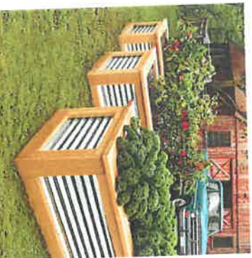
Corrugated metal with wood lining; shelving lip to rest tools; elevated.