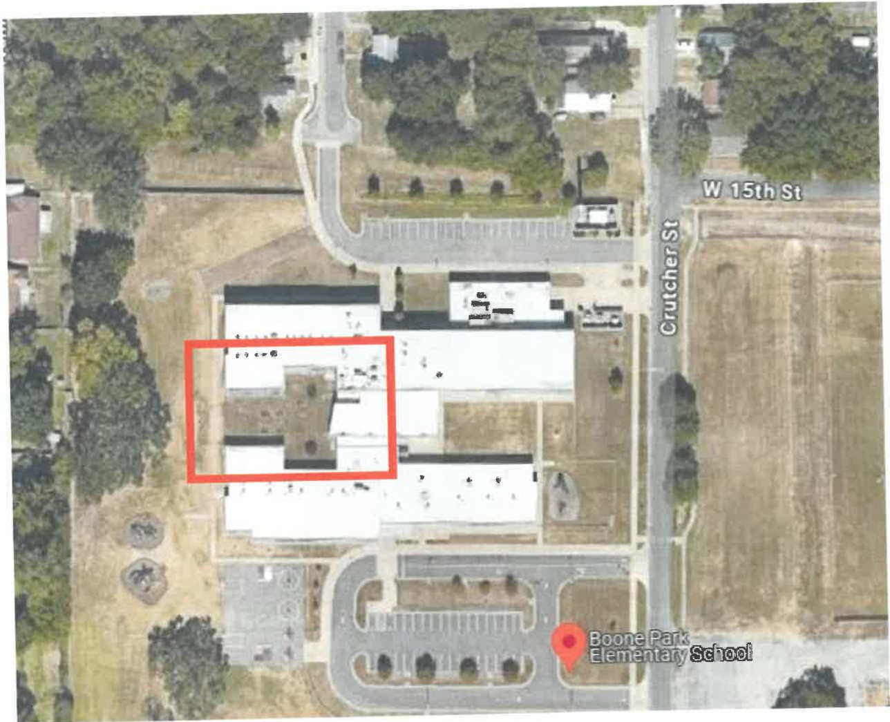
Boone Park Elementary School Garden 1400 Crutcher St. North Little Rock, AR 72114