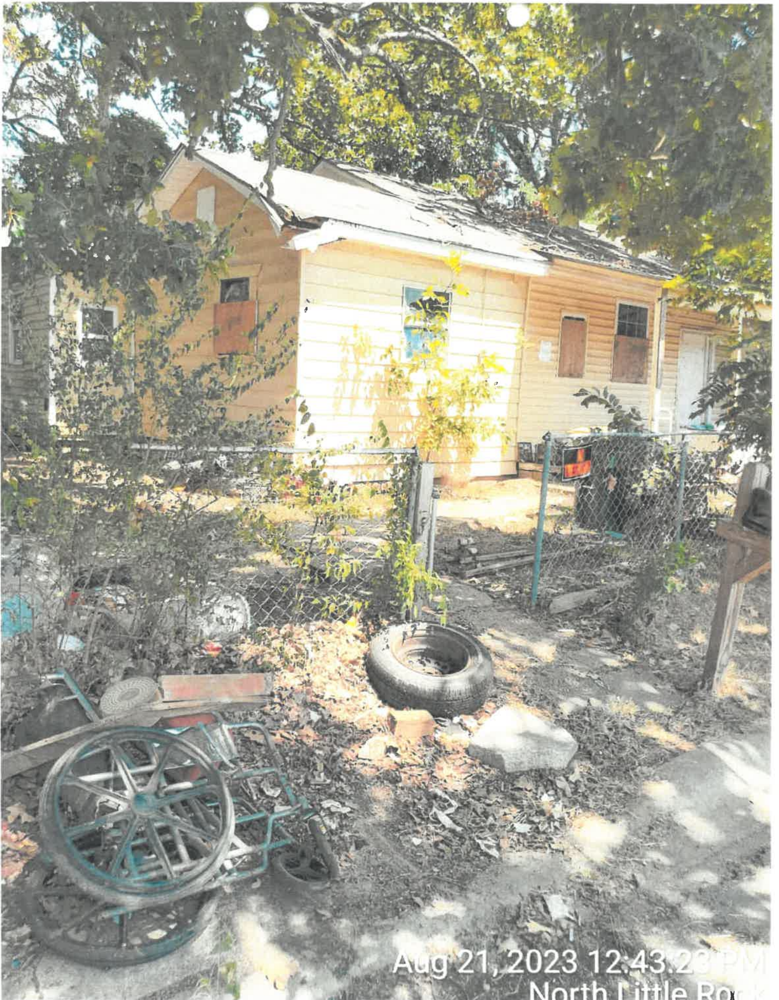
Aug 21, 2023 12:43:23 PM North Little Rock