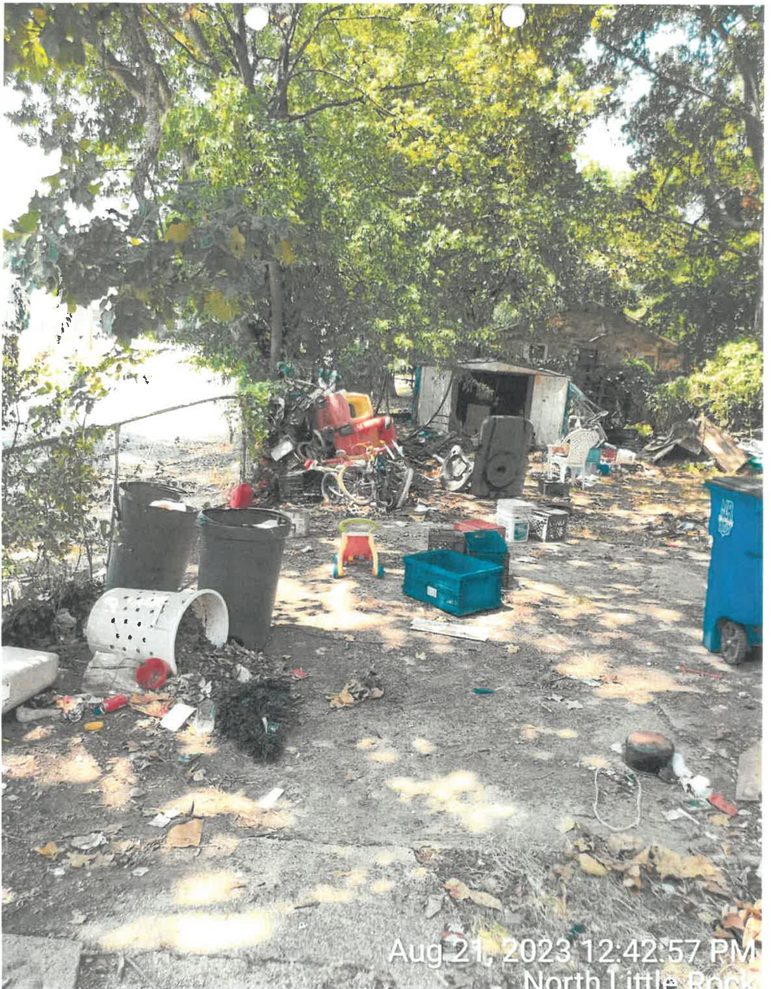
Aug 21, 2023 12:42:57 PM North Little Rock