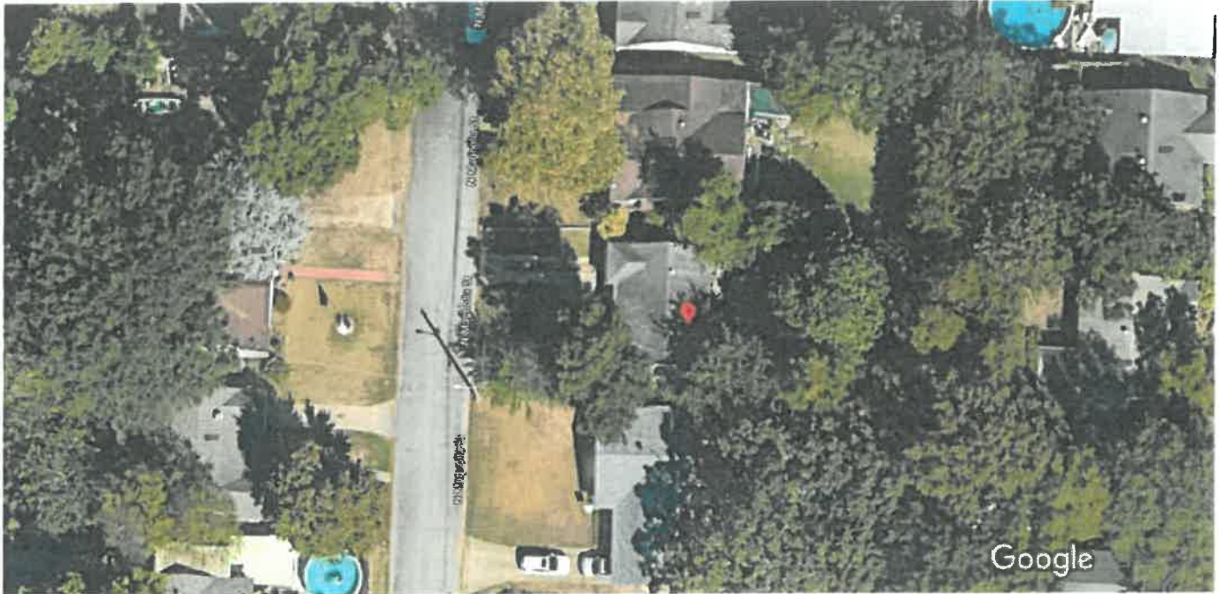
20 ft