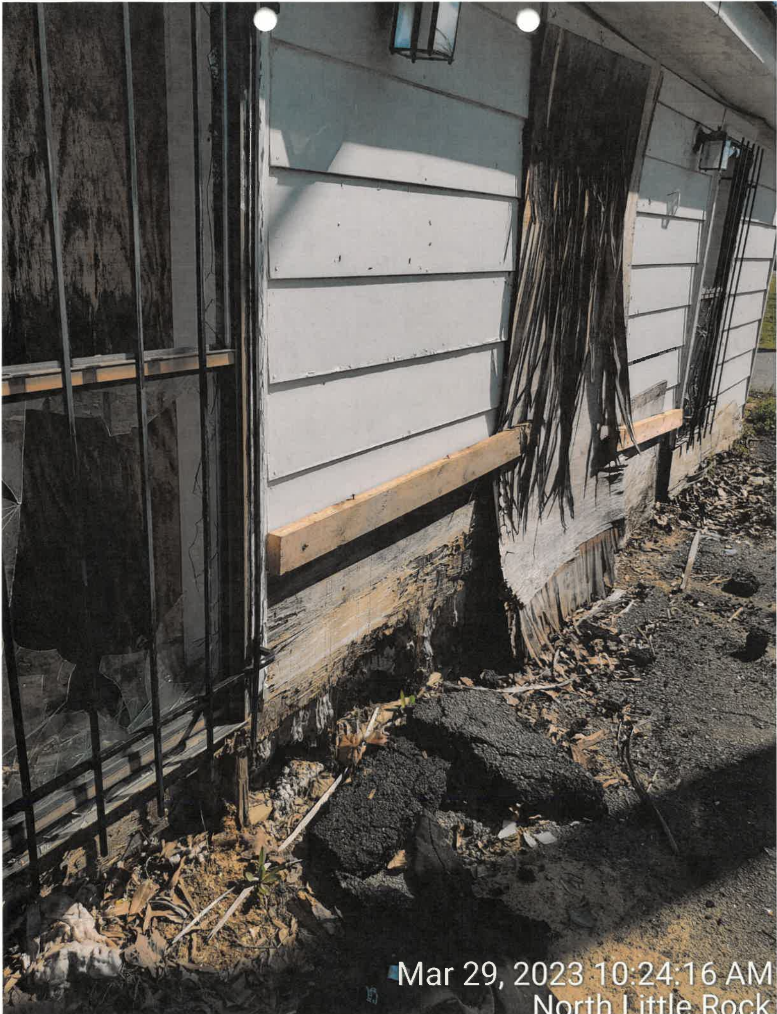
Mar 29, 2023 10:24:16 AM North Little Rock