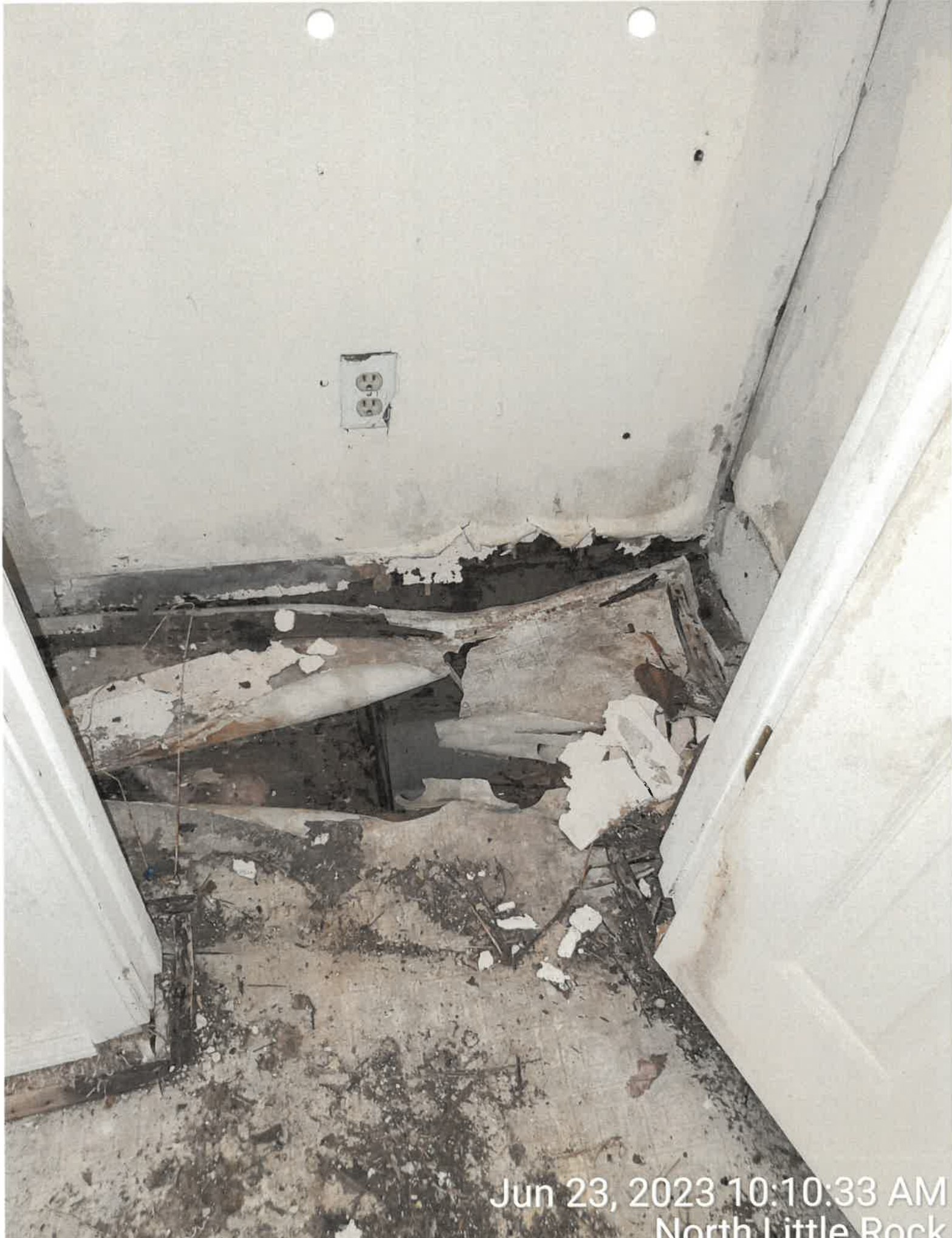
Jun 23, 2023 10:10:33 AM North Little Rock