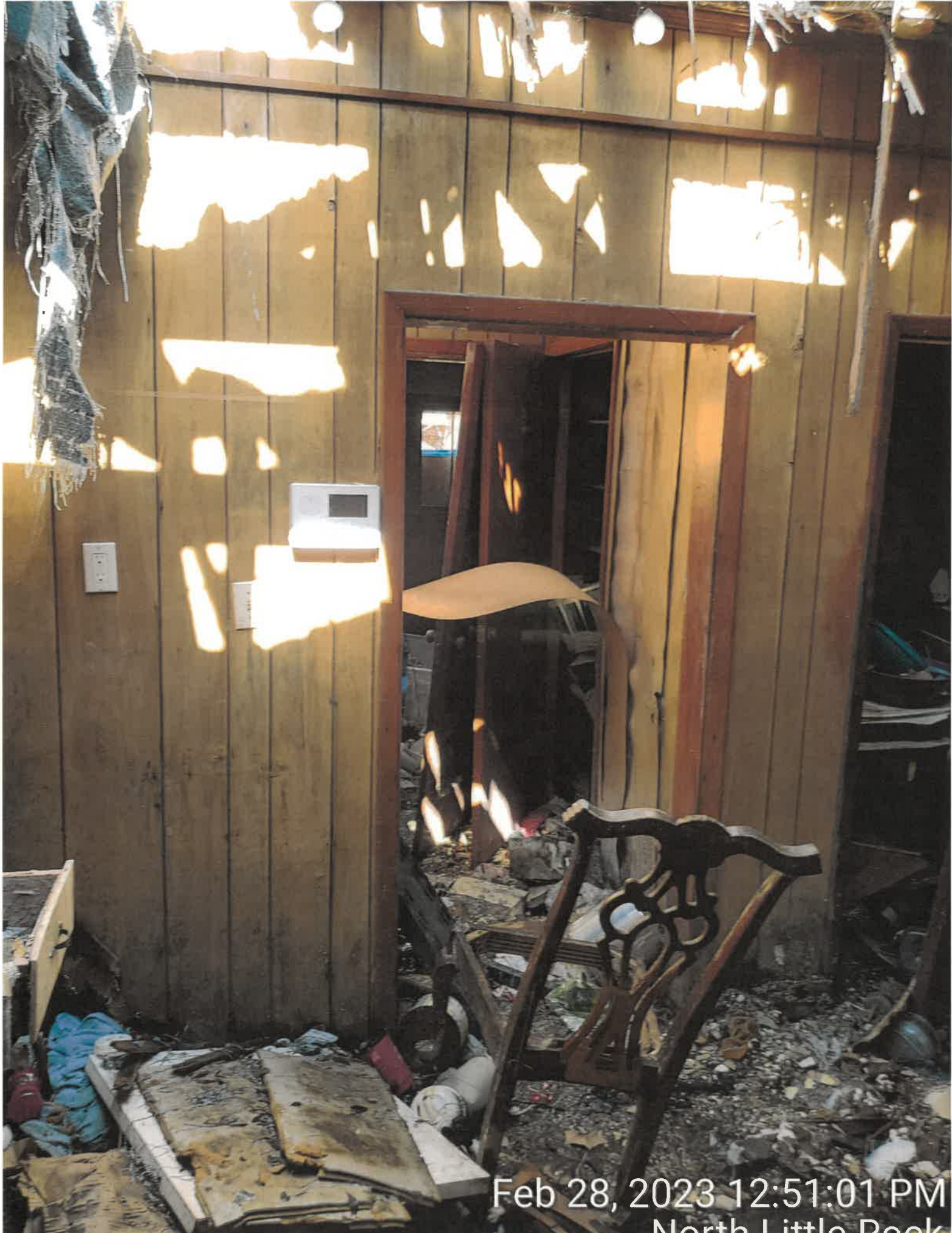
Feb 28, 2023 12:51:01 PM North Little Rock