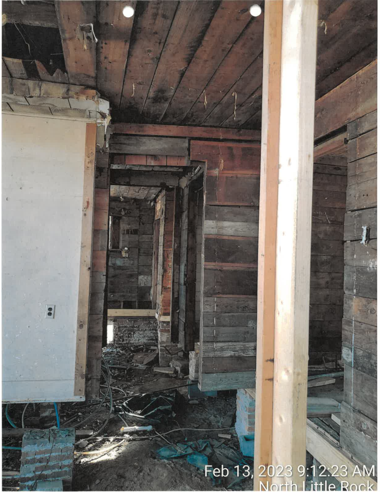
Feb 13, 2023 9:12:23 AM North Little Rock