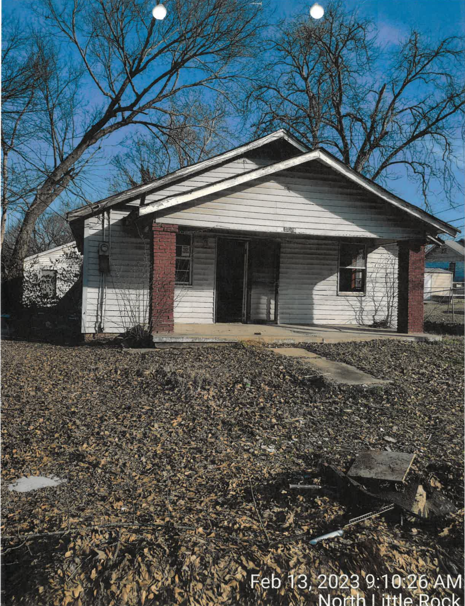
Feb 13, 2023 9:10:26 AM North Little Rock