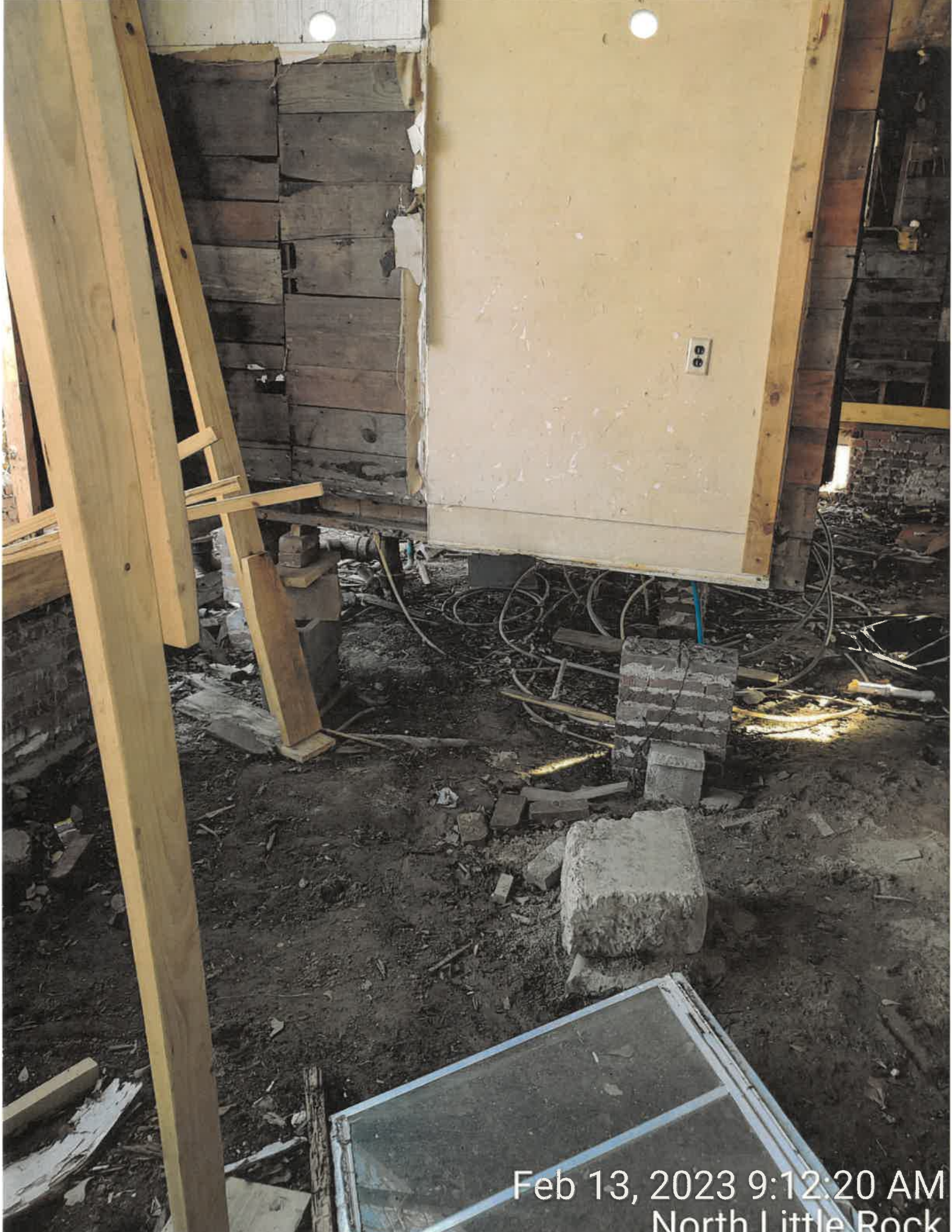
Feb 13, 2023 9:12:20 AM North Little Rock