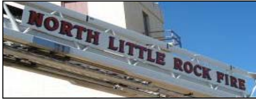
North Little Rock's newest Fire Station, # 11 was dedicated during a Ceremony and Ribbon Cutting held October 16, 2015