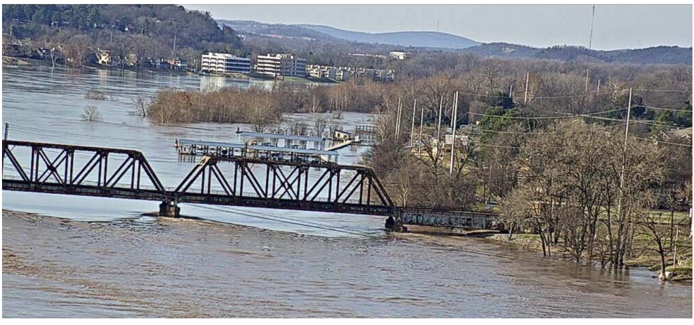
More Arkansas River flooding photos