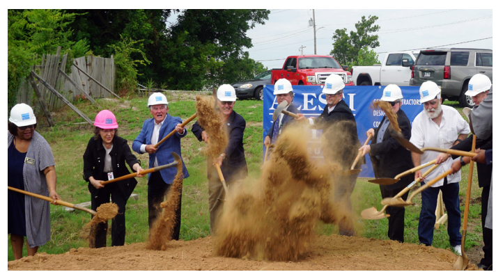
Page -2- September/October 2022

For the past 9 years the neighborhood residents have had to drive outside the neighborhood for medical care. Many of the residents in the area don't have transportation and wait times in an Emergency Room can be long.