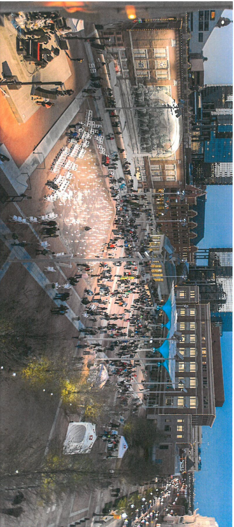
Sundance Square – Fort Worth, Texas