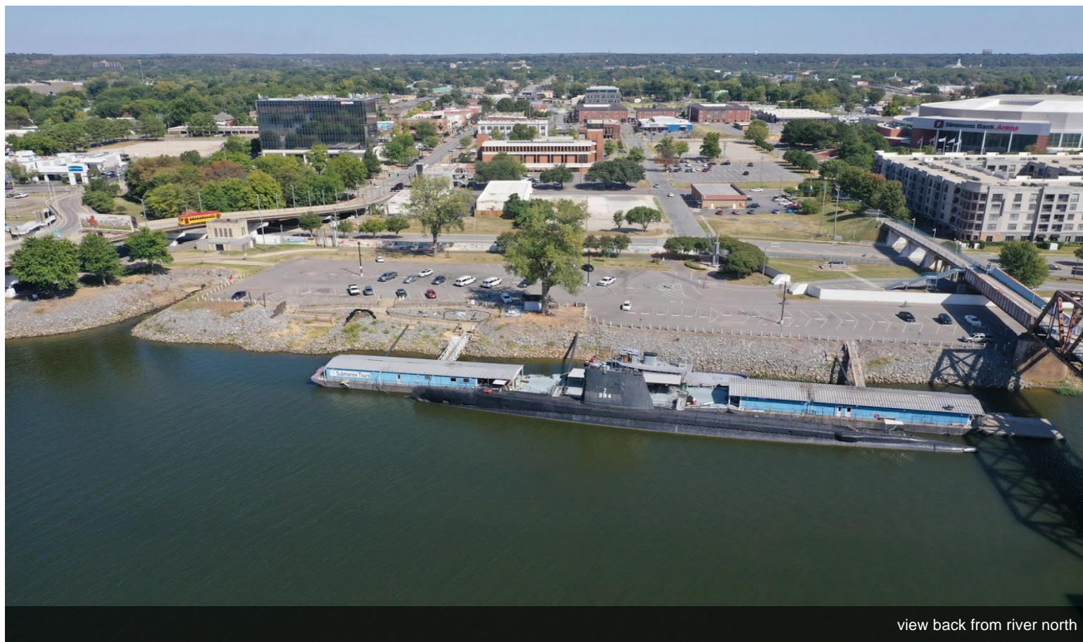
view back from river north