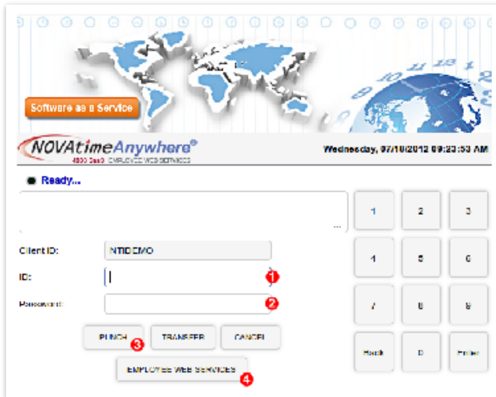
Figure 2.1 – EWS Login

To access the system, you will need a standard Internet browser (preferably Windows® Internet Explorer® or Mozilla Firefox®). Consult your supervisor for URL and ID.